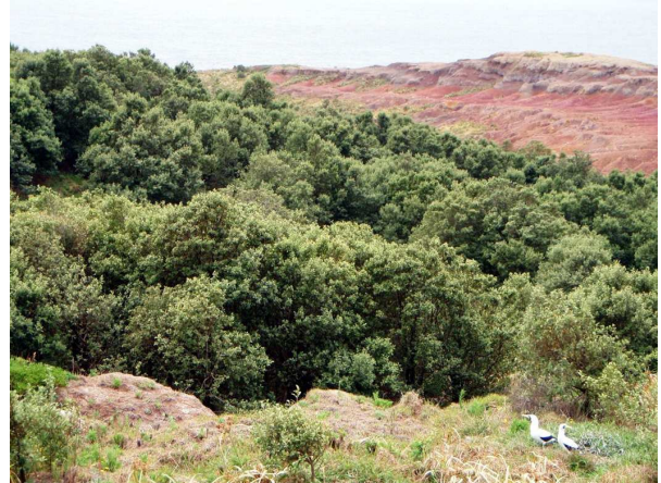
The same area on Phillip Island in 2008 after the feral animals were removed.