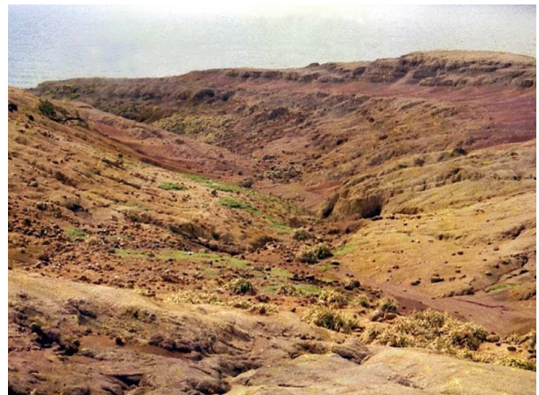
Phillip Island in 1979 after pigs, rabbits and goats had destroyed the vegetation

'Was the cost and effort of eradicating rabbits from Phillip Island justified? I feel sure it was as both flora and fauna have benefited greatly and the ecosystem's continuing recovery will bring more benefits.' Peter Coyne, Journal ANPS Canberra Region , in press, 2010.