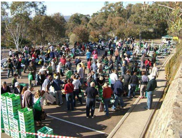
Plant Sale in full swing, 8.40am.