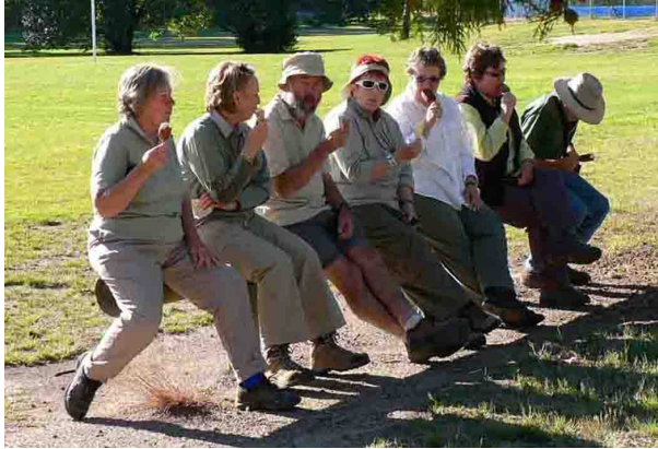
Ice Creams at Captains Flat Wednesday Walkers April 2009