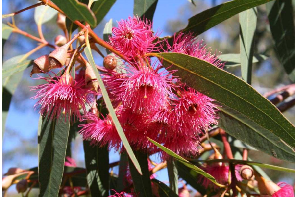
Eucalyptus leucoxylon rosea