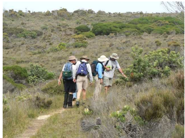
Green Cape