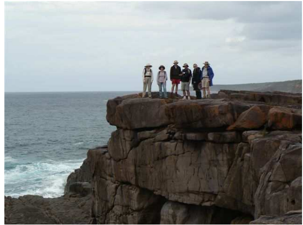
Rock ledge, Green Cape