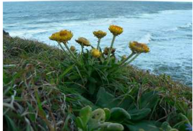
Xerochrysum, Norries Head (Murwillumbah)