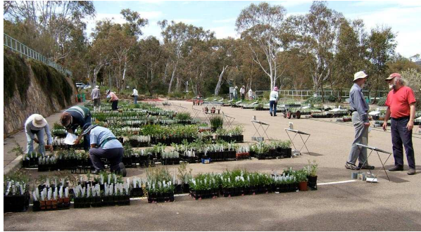
Plant Sale October 2007