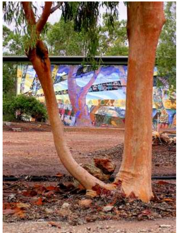
Myall Park Botanic Garden