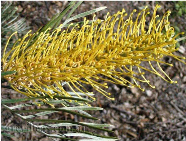
Grevillea 'Sandra Gordon'