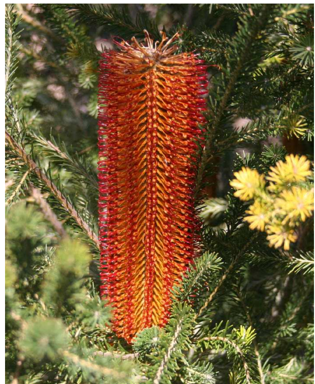
Banksia ericifolia.

“Eremophilas are becoming an extremely popular plant in the garden because of the tremendous variety in foliage and their masses of stunning flowers ...which attract birds, butterflies and native bees to the garden.” From the cover of the book above published by Bloomings Books in 2008.