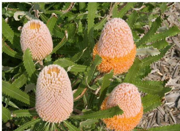
Banksia prionotes.