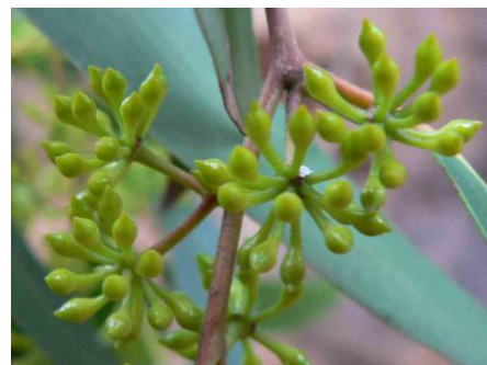
Eucalyptus fastigata buds