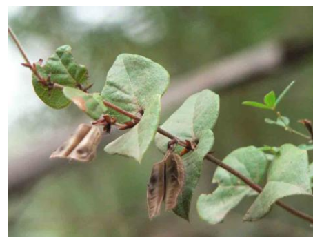
Platylobium formosum seed pods