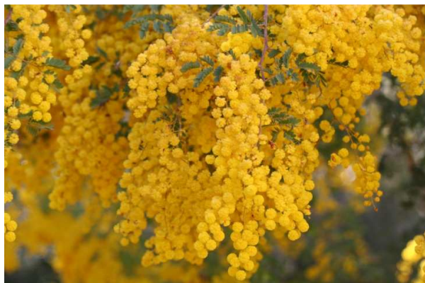
Acacia spectabilis