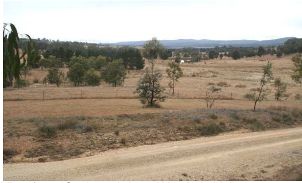
View from 'Cockatoo' down Wamboin Valley