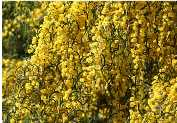
Acacia aff. verniciflua 'Avenal' – Sigma Wattle

the rules under which plants are named, to allow a "compromise solution" to the Acacia problem. One proposal would have allowed botanists to continue to use the name Acacia for all the segregate genera; a second proposal would have created new names - Austroacacia and Protoacacia - for the Australian and African-American groups respectively. Delegates at the Section voted, again by large majorities, to reject these compromise proposals. While many expressed an understanding of the difficulties caused by the renaming of the African-American acacias, many argued that the compromise proposals unacceptably compromised the rules of nomenclature and created a dangerous precedent. In summary, the decisions taken in Melbourne confirm that the Australian acacias retain the name, while a new name is needed for the African and American species. Several options for achieving a good result in Africa and the Americas are available, and will be discussed and considered in the months ahead.